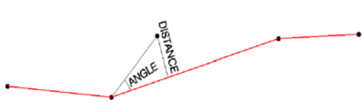
Figure 1: Terrascan iteration methodology.

There is also a maximum terrain angle constraint that determines the maximum terrain angle allowed within the model.